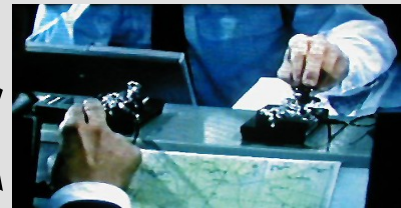
1996, Aliens defeated in Independence Day

1999-2009 100% Pass rate GW6GW KEEPING THE CODE ALIVE