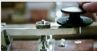
1912, Code used to save 703 lives aboard Titanic